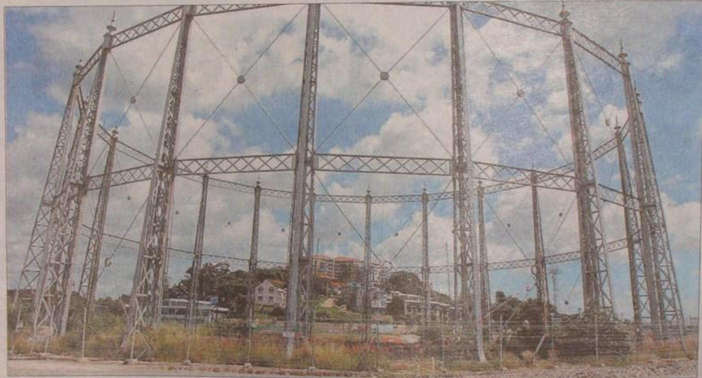
NEW for old ... FKP's Gasworks project will be built on Brisbane's former gasworks site.